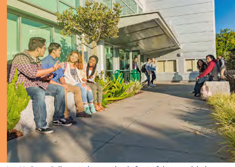
Los Medanos College students gather in front of the remodeled Student Services Center.

· Build new or remodel existing facilities for a Science and Allied Health Center at Contra Costa College.