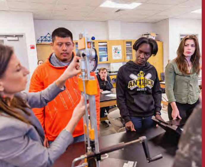
Students on Contra Costa Community College District campuses